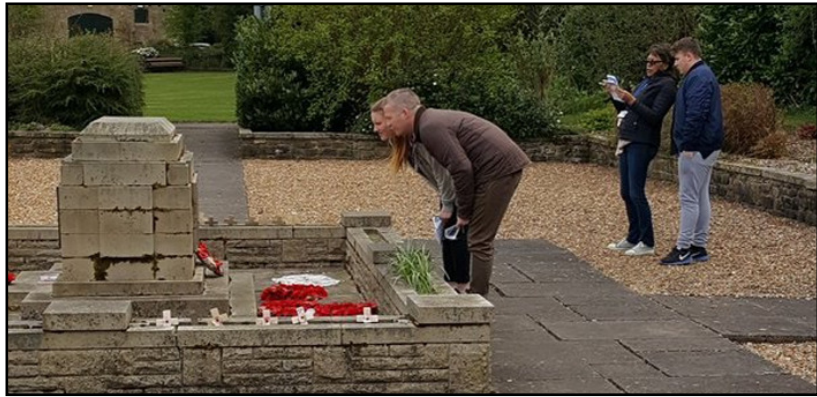
Year 11s join Calico on the Pendle Witches Murder Mystery Trail.

"They didn't find it too difficult because the instructions from the Internet were clear."