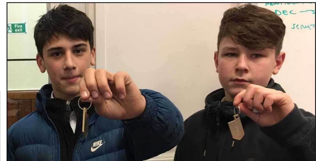
Year 9s make their own keyrings