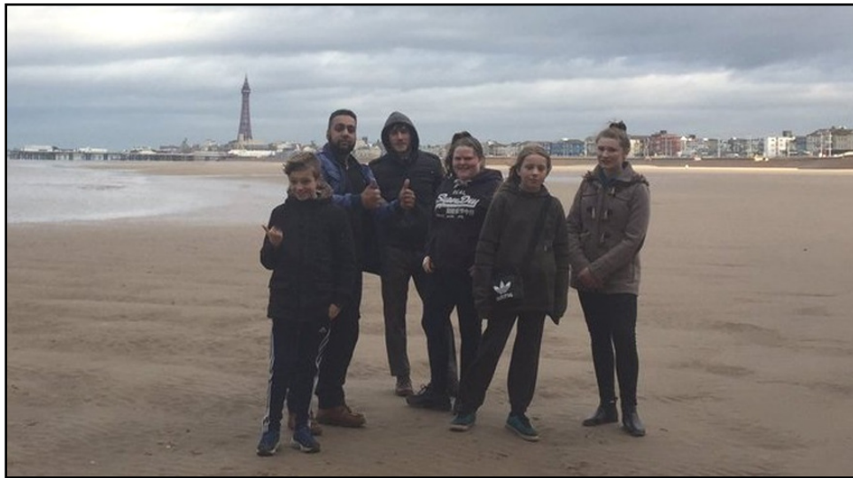
STUDENTS enjoy a fantastic trip to Blackpool