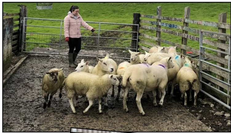
Coal Clough students learnt what life and jobs were like on a farm.