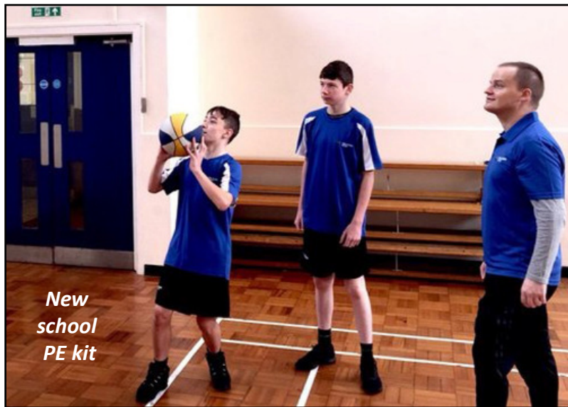
New school PE kit

Boxing is a good way to exercise, meet friends, access weights and spar with the trainer. It is also a brilliant way to keep fit and healthy.