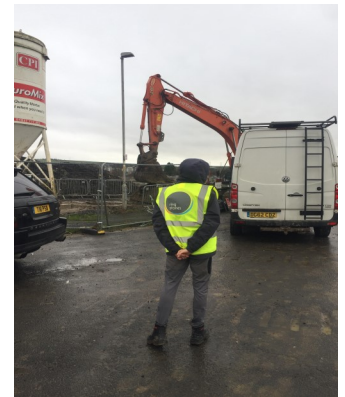
One of our Year 11's working on a local construction site in Burnley!

Throughout Autumn Term, our Year 11 students have been going on their work experience placements. Their process started by preparing for the work place in school, each student had preparation for the work place sessions and were expected to contact their employer for a meeting before their placement started. Students started their work placements in September 2019, this will be an ongoing experience throughout the year. Reports so far are that students have thoroughly enjoyed their work experience.