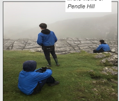
The boys taking in the views of Pendle Hill

WE took a group of year ten pupils to Malham Cove to learn about the area and its surrounding beauty. This was a perfect field trip where the boys had the chance to explore and take in the views of Pendle Hill and its surrounding area. Scenes from Harry Potter and The Deathly Hallows were filmed all around Malham and it was great to see the boys enjoy the trip. Once again our year 10 pupils were well engaged and learned about the local area and took time to paddle in the streams!